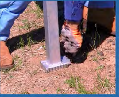
Remove retaining clip