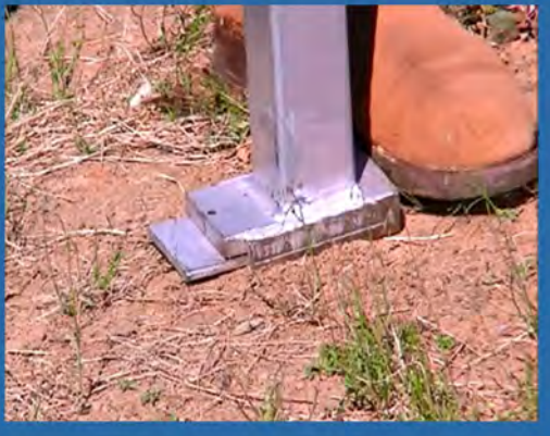
Manouvere the picket and Driver onto the picket foot