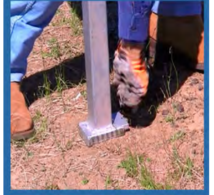
Replace the retaining clip