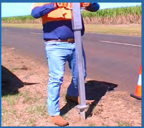
Now using two hands , remove the picket