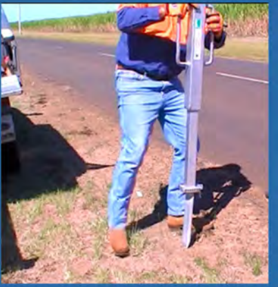
Manouvere the picket and Driver into the installation position