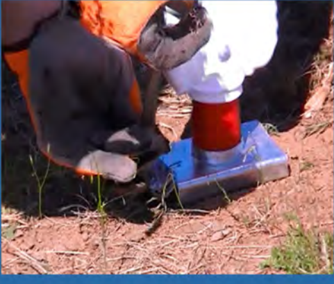
Using the supplied crimping tool uncrimp the end tag on the acceptor plate