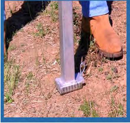
Drive picket to ground level