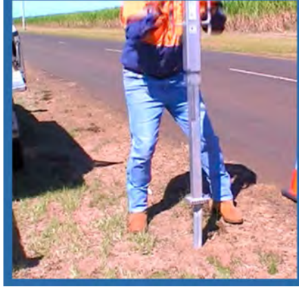
Now using two hands , drive the picket