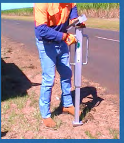
Remove slide retaining clip from driver body