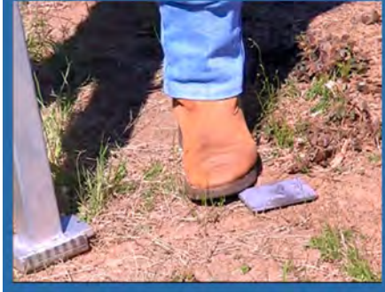
Remove driver from picket