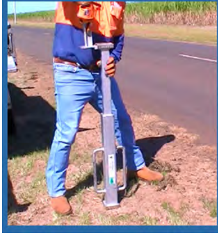
Turn Driver upside down and remove R clip. Slide picket foot into driver.