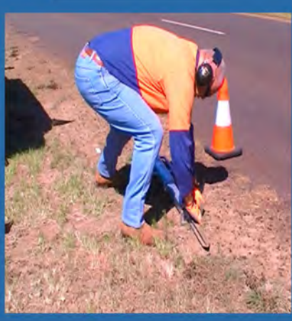
Remove retaining clip