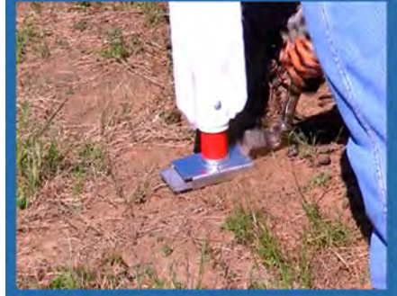
Install post onto picket