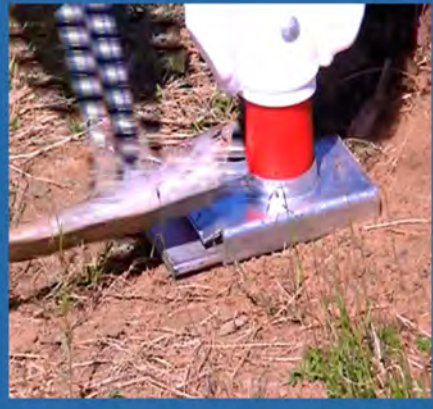
Remove post from picket foot