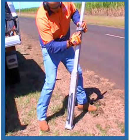
Insert retaining clip into the driver