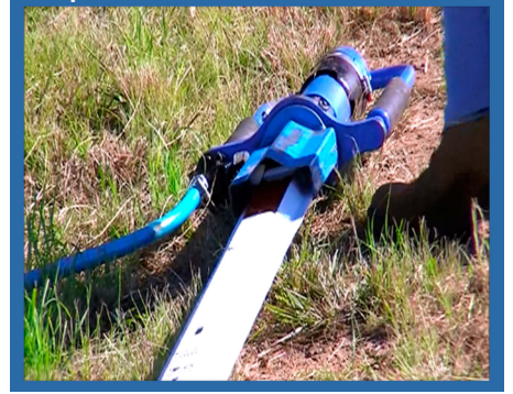
Insert steel post and cap into the driving slot in the Pnuematic Driver,