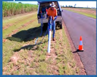
slowly lift the Pnuematic Driver and post into position