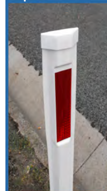
Fit safety cap