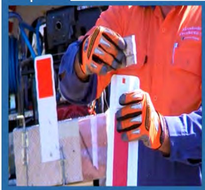
Remove W shape cap from the post.