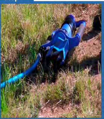
Remove Pnuematic Driver from the post.