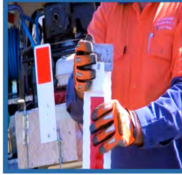
Fit W shape driving cap FPD to the steel post