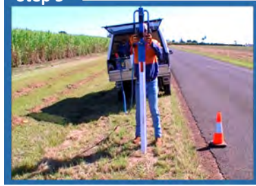
Ensure the post is straight and begin installation.