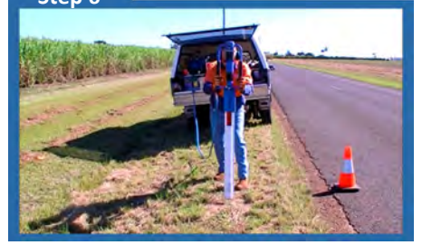
Ensure the post is installed to the depth mark.