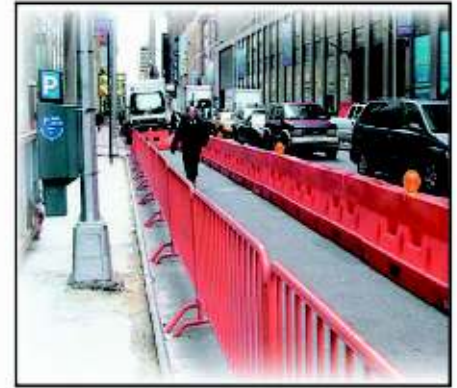
Temporary Pedestrian Walkway