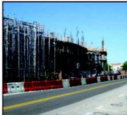
Longitudinal Channelizing Barricade