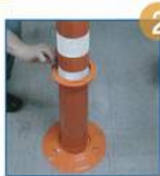
2 Cover Assembly component