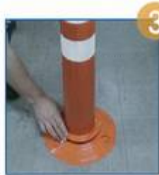
3 Tighten Assembly component