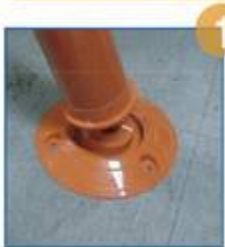
1 Insert PU post on bottom part